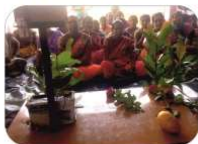
Environment day celebration at Devgiri