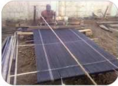
Blanket making at salapur Co-op