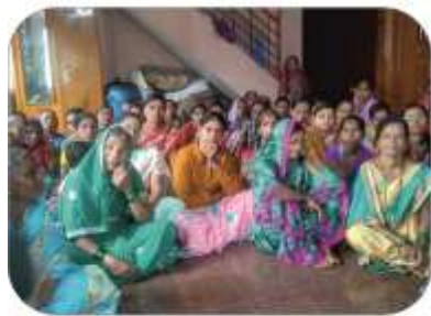
Village level Federation at San Hosur