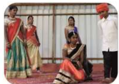
Personality Development-FVT at ROC