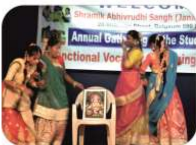
Annual Gathering - Cultural programme - FVT