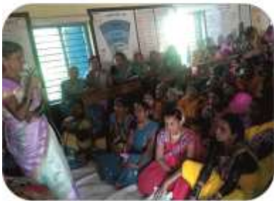
SHG Capacity Building at Bidarbhavi