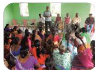
Hukkeri Taluka level Federation