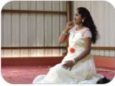
Personality Development - FVT at ROC