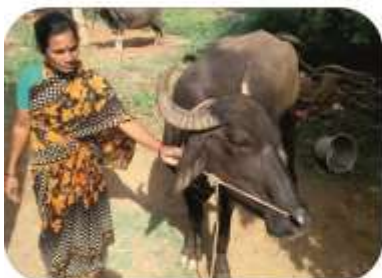
Latama of Vinayak shg Yalladkere