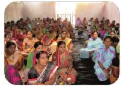
NRLM awareness at chivattugundi