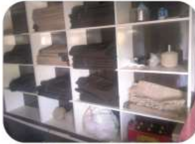
Blankets for sale at Salapur Co-op