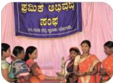
International Women's Day at ROC