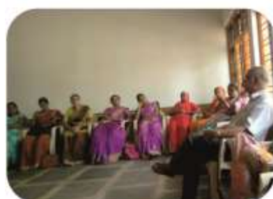
Belgaum District level Federation at ROC