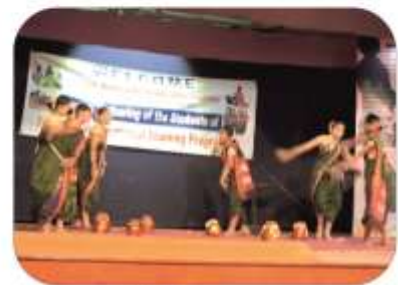
Annual Gathering - Cultural programme - FVT