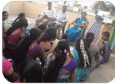
SHG Capacity building at Kuntinagar