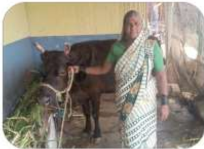
Siddavva of Hemavati shg at Damba, Cow Breeding