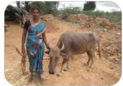
Devamma of Saraswati shg Ajjanatti