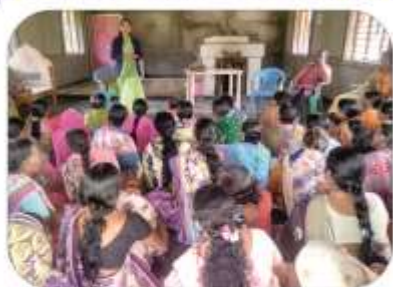
Village level Federation at Dod Hosur