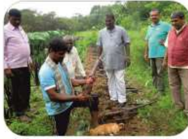
Organic Farming visit at Watere