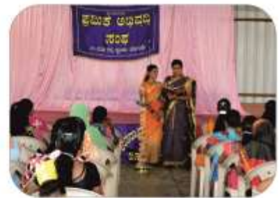
International Women's Day at ROC