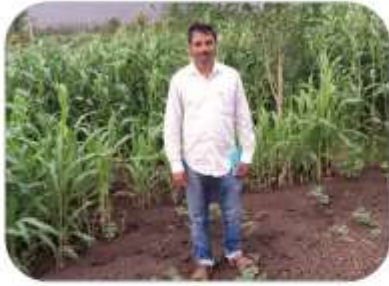
Maize fodder at Kendur