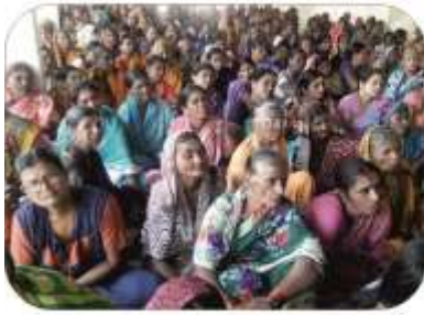
MGNREGA awareness at Markatti