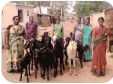
Bhagalaxmi shg of Lokur Goat farming