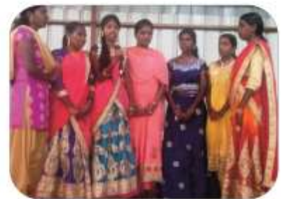
Personality Development-FVT at ROC