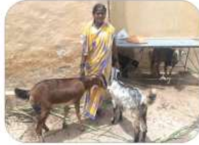
Manjula of Hemavati shg at Dambal, Goat breeding