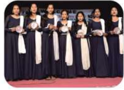
Annual Gathering- FVT