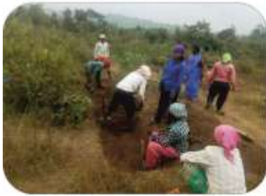
MGNREGA at Nesargi