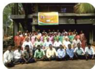
Kitchen gardening training at Gugrenatti