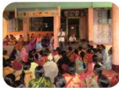
NRLM awareness at Anigol