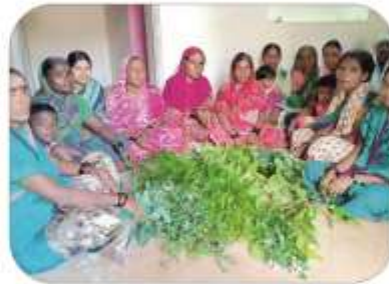
Herbal leaves for EVTraining at Bendigeri