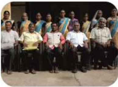
SHG Capacity building at Mavnoor