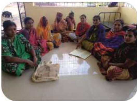
SHGwomen discussing on various issues at Salahalli