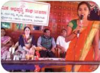
SHG Capacity building at Nagurda