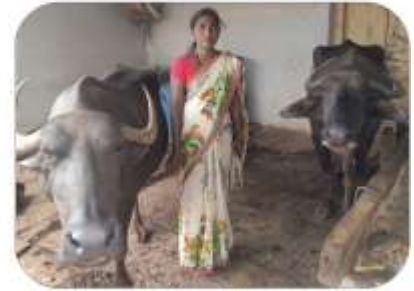
Sumangala of Hemavati shg Dambal, Buffalo Breeding,