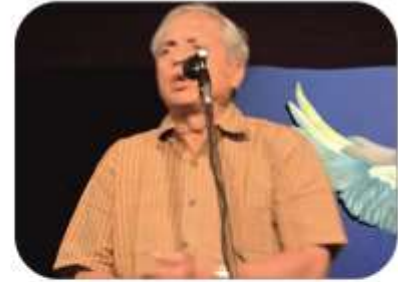
Annual Gathering- FVT