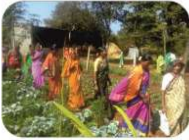
Organic Farming visit at Ambewadi & Hunsewari