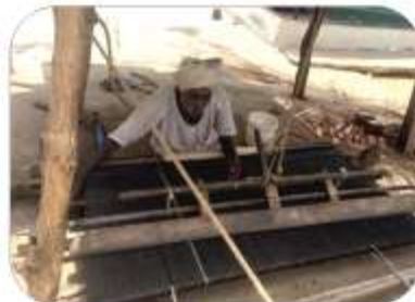
Parasappa, blanket making at Bannikoppa co op