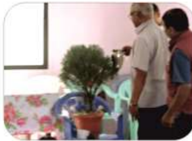
SHG Capacity building at Paschapur