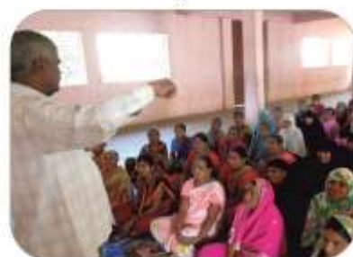
Organic Farming Visit at Hunsewari