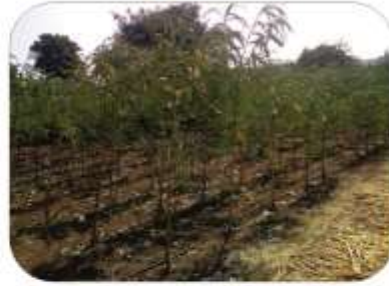
Fodder production at Hangarga sheep farm