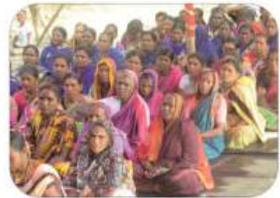
SHG Capacity Building at Torangatti