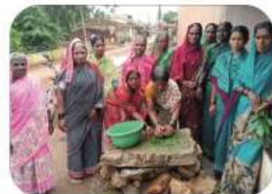
Production of Ethno Vet Medicines at Bendigeri