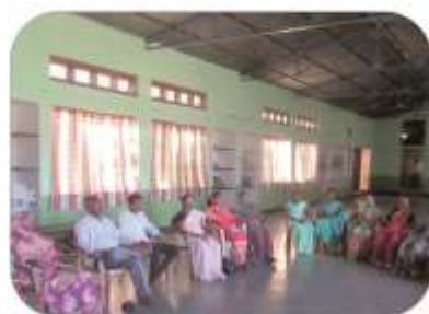
Bailhongal Taluka level Federation at CN Nesargi