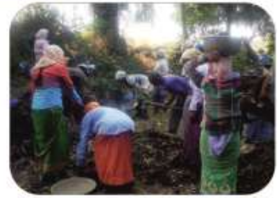
MGNREGA at Nesargi