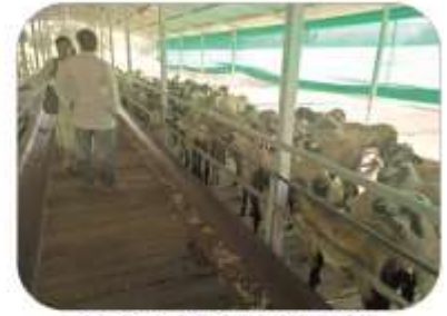
Somanath sheep Farm , Hangarga