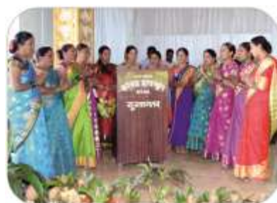
Gram Panchayat Federation at Karambal