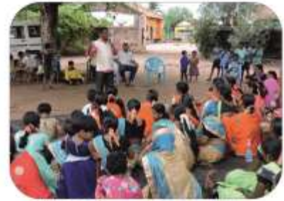
SHG Capacity building at Mavnoor