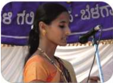
SHG Capacity Building at Hiremunolli