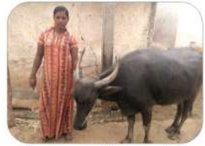
Bhagyama of Saraswati shg Ajjanatti