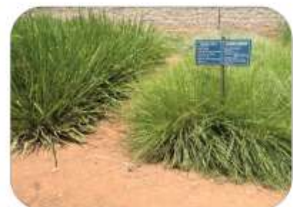
Fodder Guinie grass at Research Centre, Hesargatt