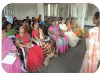
Khanapur Taluka level Federation