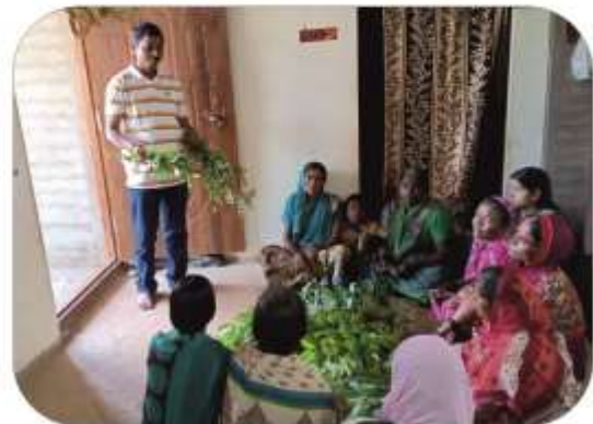
VLW Padeppa explaining about Ethno leaves