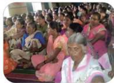
Gram Panchayat Federation at Garlgunji