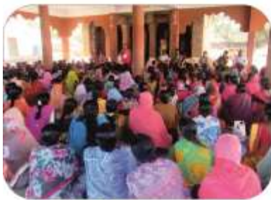
NRLM awareness at Mekkalmaradi