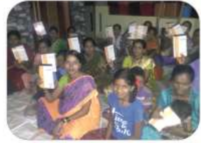
PMKVY(SKILL INDIA) training at Gugrenatti