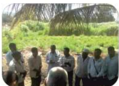
Organic Farming visit at Handignur