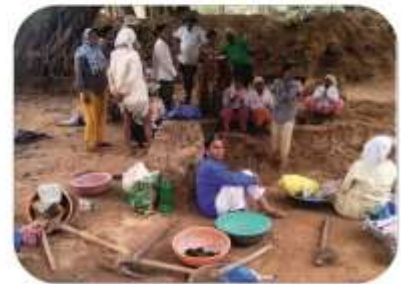
MGNREGA at Koundal